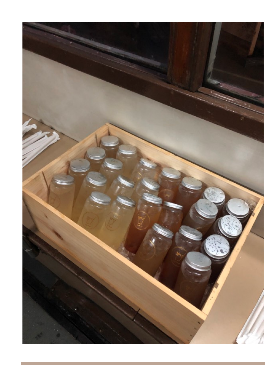
400 ml + 600 ml (plastic bottle with lid)

100 x 400ml (M)/ 65 x 600ml (L) drinks + delivery