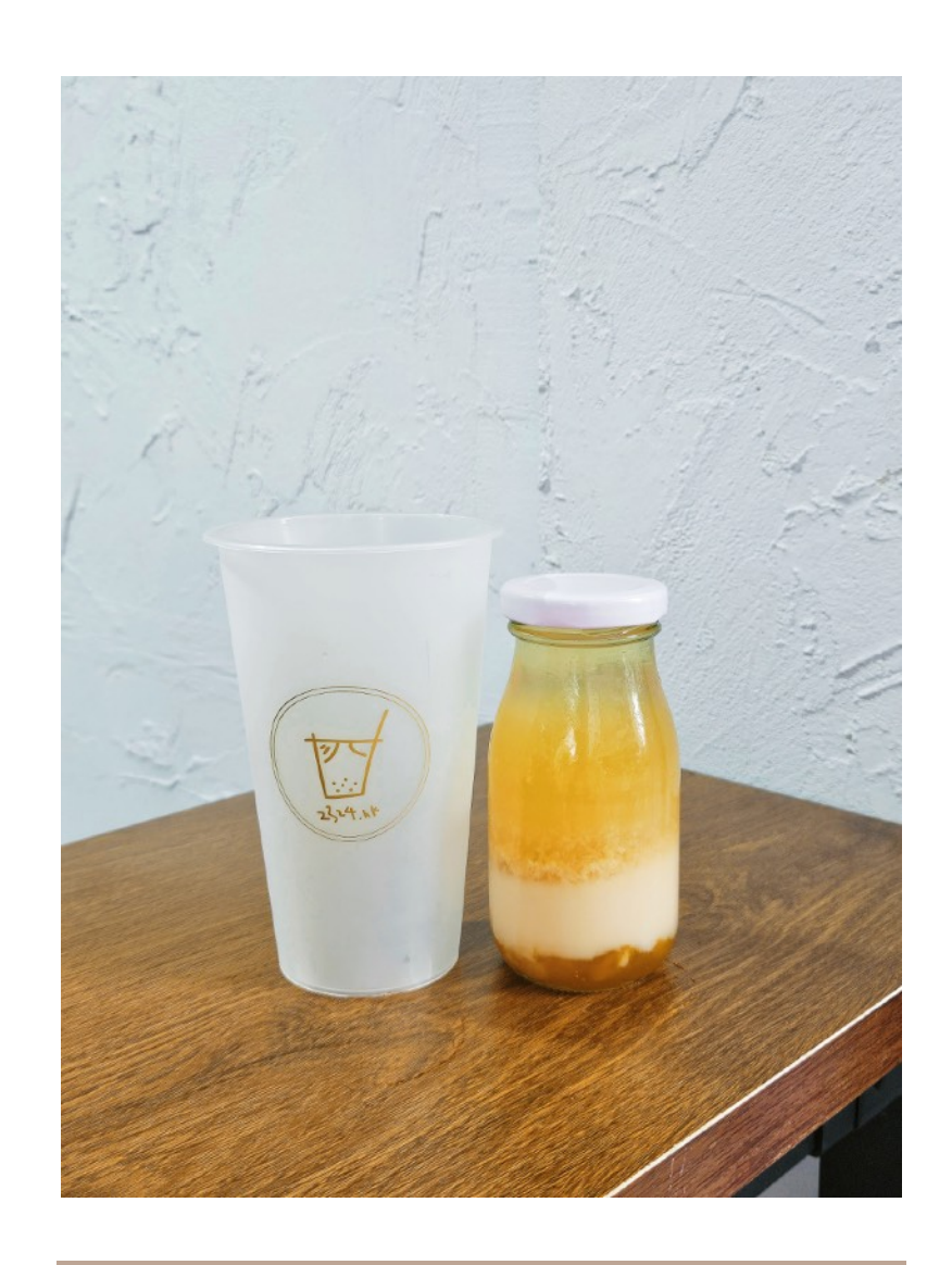
200ml (mini glass containers with lid)/ 400ml/ 600ml (regular cups with lid)

100 x mini glass / 50 x 400ml (M) drinks/ 30 x 600ml (L) drinks + delivery